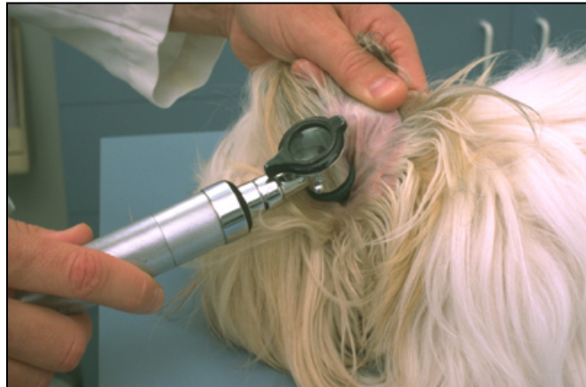
Otosopic exam of ear canal.

An important part of the evaluation of the patient is the identification of underlying disease. Many dogs with chronic or recurrent ear infections have allergies or low thyroid function (hypothyroidism). If underlying disease is suspected, it must be diagnosed and treated or the pet will continue to experience chronic ear problems.